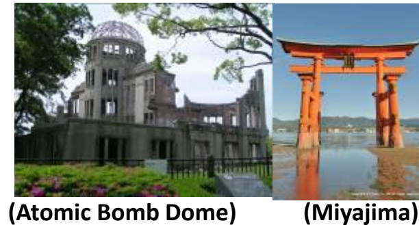
(Atomic Bomb Dome)

As the memorial of 10 th anniversary of AVEC, CD-ROM including all technical papers from the 1 st AVEC (approx. 1,000 papers) was provided to the participants.